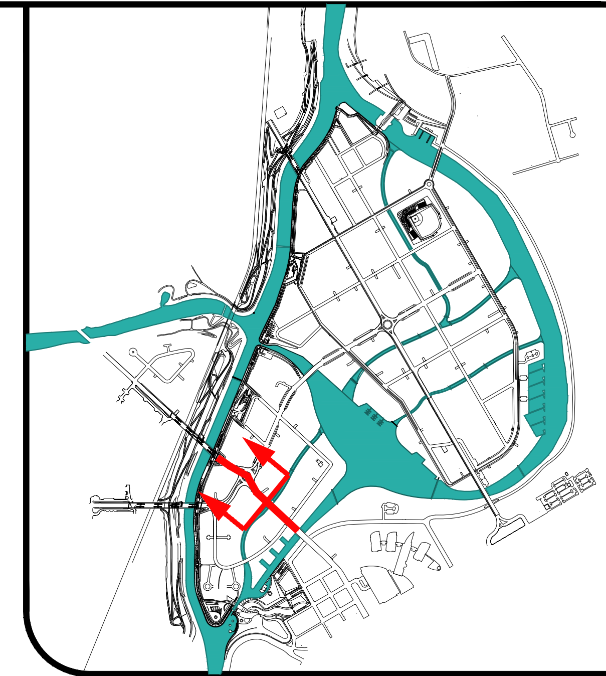
LOCATION MAP NTS